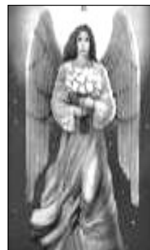
Be an Angel!

Make check payable to : Rogers City Community Theatre Mail completed form to: 257 North Third Street Rogers City, MI 49779