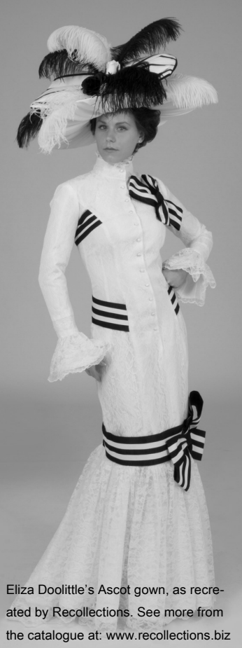
Eliza Doolittle's Ascot gown, as recreated by Recollections. See more from the catalogue at: www.recollections.biz

In addition to the Ascot dresses, which were elegant black and white formal wear, Eliza's Cockney flower-girl dress was a big hit. If you missed the show, or want to relive it, you can see the costumes on the Recollections web site, www.recollections.biz